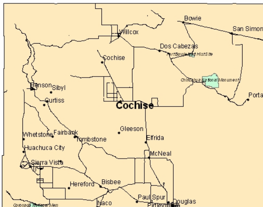
Figure 1. Cochise County, AZ